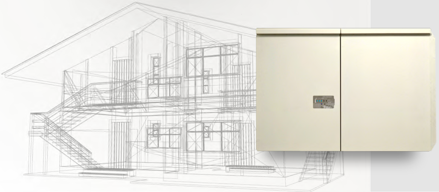
Evolve with 13 kWh capacity shown.